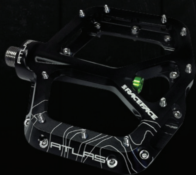
ATLAS PEDAL >