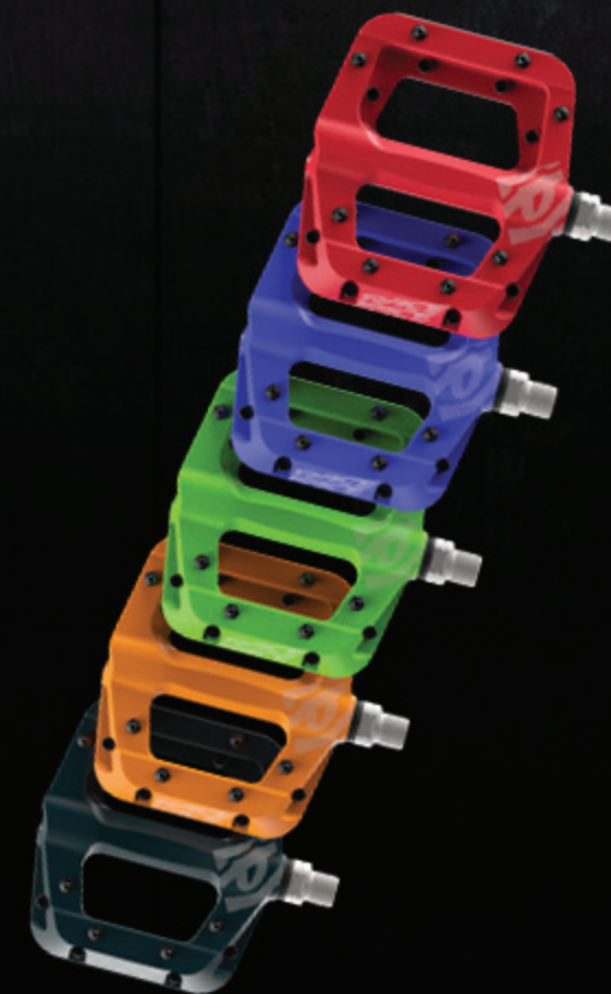
NEW! CHESTER PEDAL >