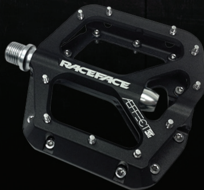
EFFECT PEDAL >