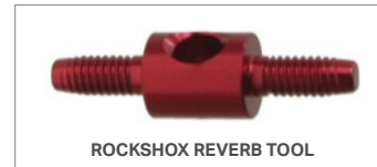
ROCKSHOX REVERB TOOL